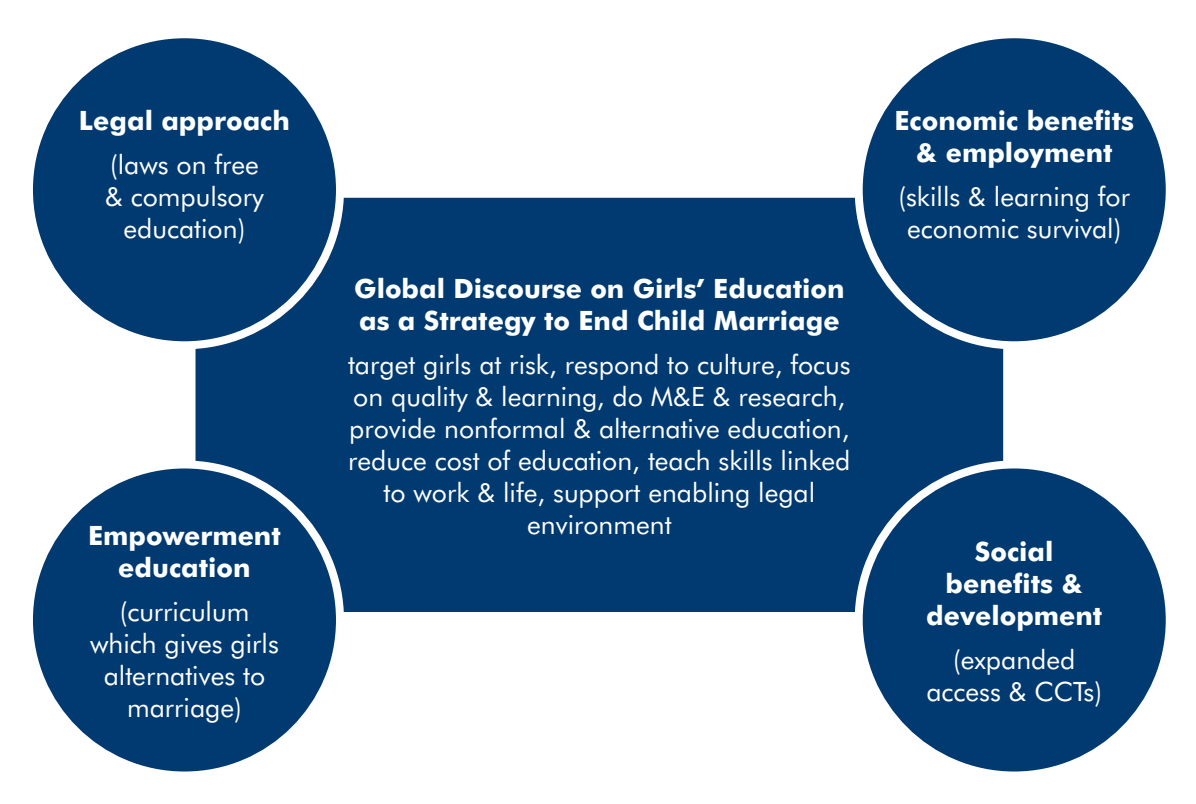
FIGURE 1. APPROACHES TO END CHILD MARRIAGE THROUGH EDUCATION AND EMERGING POINTS OF CONVERGENCE

1. The social benefits approach has its origins in the girls' education and fertility literature of the 1950s. This approach presents a scientific case for how education contributes to a